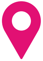
Chart New Territory